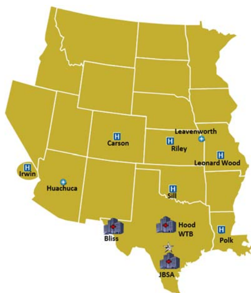
Figure 2-4. Regional Health Command - Central's Health Service Areas