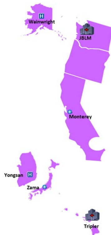
Figure 2-3. Regional Health Command - Pacific's Health Service Areas