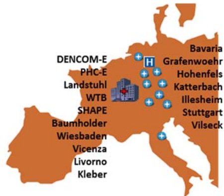
Figure 2-1. Regional Health Command - Europe's Health Service Areas